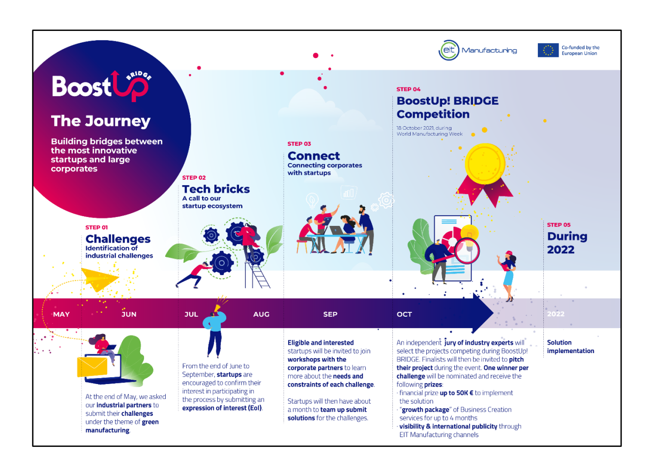
Table 4 - BoostUp! Bridge program milestones (2021 edition)