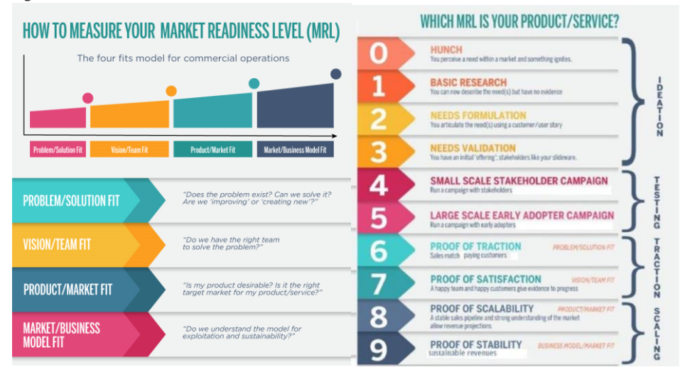
Figure 2: How to measure MRL and MRL levels